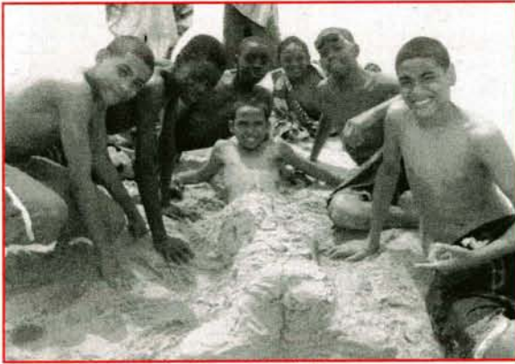
Sand and sun at the Young Men's Retreat

Success, engaging nearly 100 current and newly enrolled male participants from our Rising Stars, Bridges and teen programs as well as youth staff and other staff mentors from across Union Settlement programs.