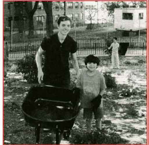
A volunteer from Alp Invest Partners and his able assistant

AlpInvest Partners, Condé Nast and Goldman Sachs Community Team Works (CTW) sent crews of volunteers to help in our gardens, building plant boxes, weeding, laying down much-needed new soil, planting trees, flowers and vegetables and weatherproofing our gazebo and picnic tables. In turn, with the help of Youth at Union and frequent partner, Concrete Safaris, our volunteers established a brand new garden at our Washington Houses Community Center, home of Youth at Union and Settlement College Readiness headquarters as well as our Washington-Lexington Senior Center.