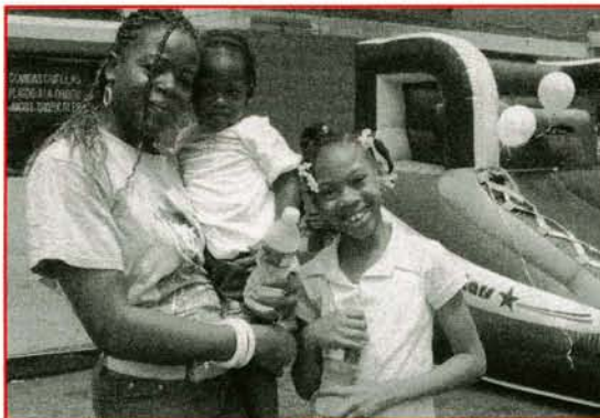
Making the rounds at the Ethnic Festival