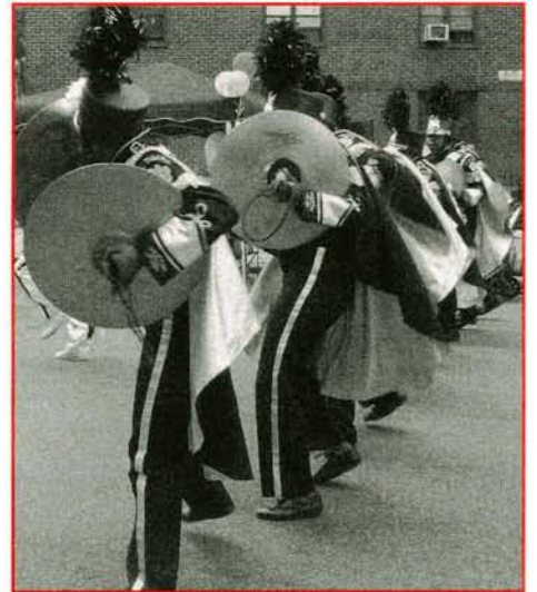
Soul Tigers in action

Always-popular Clowny the Clown entertained children, as did Dora the Explorer, Scooby Doo, SpongeBob SquarePants and Elmo, all of whom joined the festivities. Goldman Sachs Community Teamworks volunteers ( see related article on page 2 ) were on hand to assist with art projects, serve cotton candy, lead games and a host of other activities.