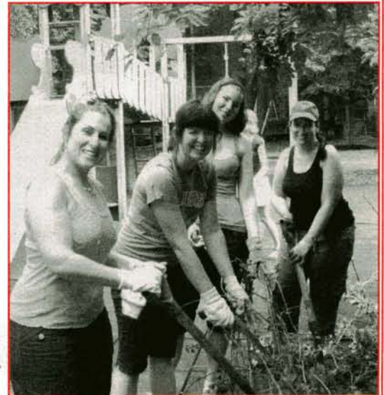
Goldman Sachs volunteer twirls cotton candy while Condé Nast volunteers dig in