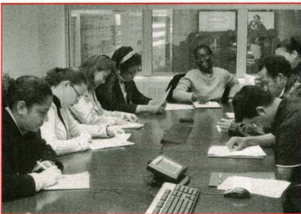
Taking notes in the boardroom at Lehman Brothers

In addition to their help in the garden, Goldman Sachs CTW continued a long standing tradition of helping run events at our Annual Ethnic Festival, an all day street festival celebrating the many cultures of East Harlem. CTW volunteers ran everything from the popcorn and cotton candy machines to a basketball toss and the inflatable "Magic Castle."