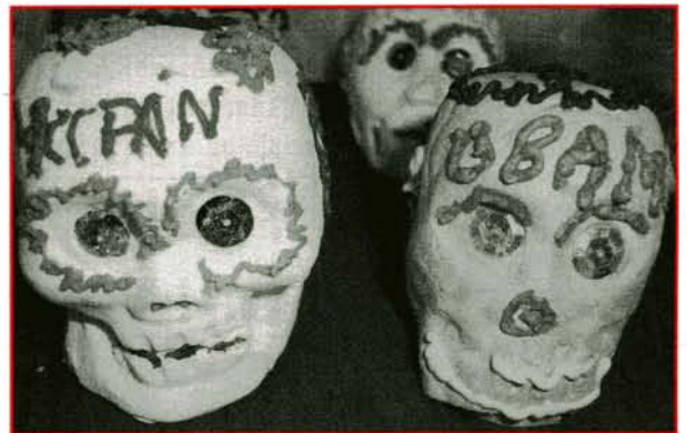
Pre-Election Day sugar skulls

It seemed like every spare corner of Union Settlement's cavernous gym was filled with children, students, parents, seniors and other community members for the 13th Annual Day of the Dead celebration. The eager crowds, which flowed out into the corridors, were treated to an electrifying evening of live music, dancing, poetry, skits and warm remembrance of loved ones who have passed.