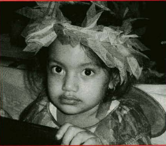
Costumed cutie lines up for a Day of the Dead meal.