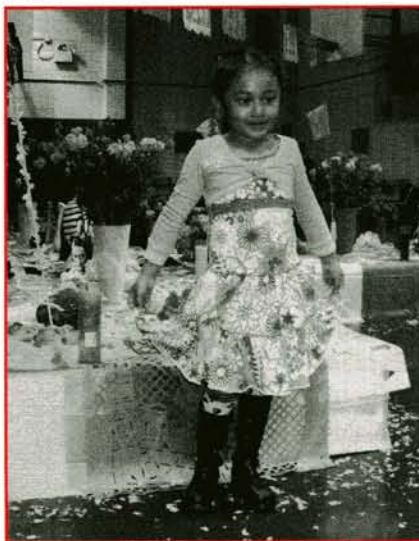
A young participant before the altar

Activities in the gym were underway all day with the construction and festooning of the traditional altar, led by artist Miguel Cossio.